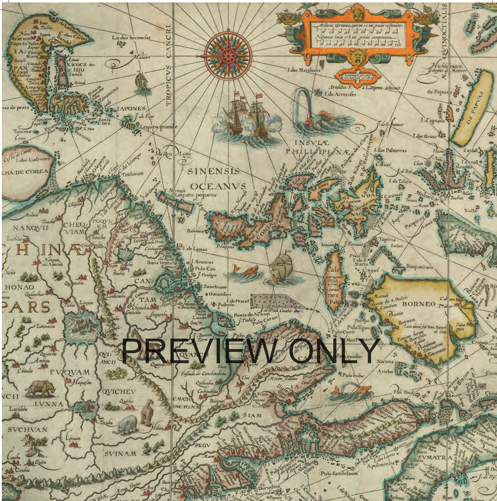
LINSCHOTEN, Jan Huygen. Exacta & accurata delineatio cum orarum maritimdrum tum etjam locorum terrestrium quae in regionibus China . Amsterdam, 1595.

From Hubbard Collection of "Japan and Southeast Asia".